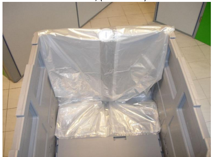
Place the top end of the liner over the edge, the bottom of the liner should be totally flat.