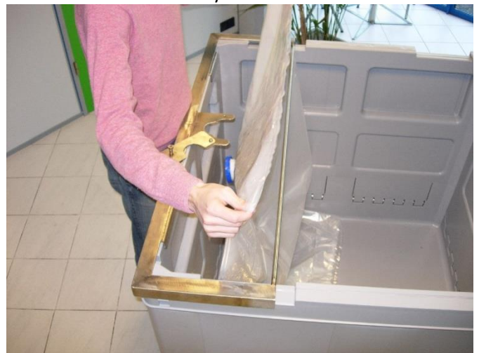
Place the filling bridge and pull the liner upwards and place it over the rod.