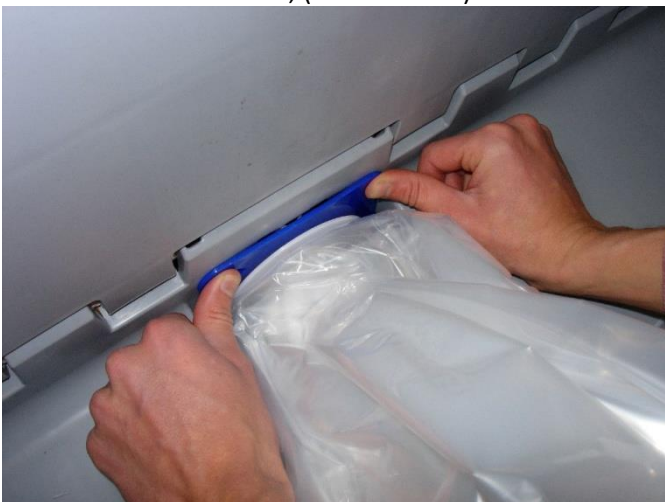
Press the top end of the clip firmly until all. edges of the clip are against the container.