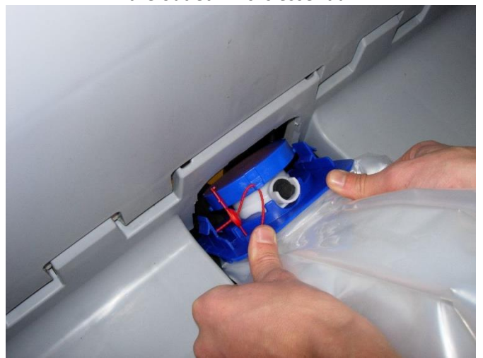
IMPORTANT, first place the underside of the clip in the channel, (inside view).