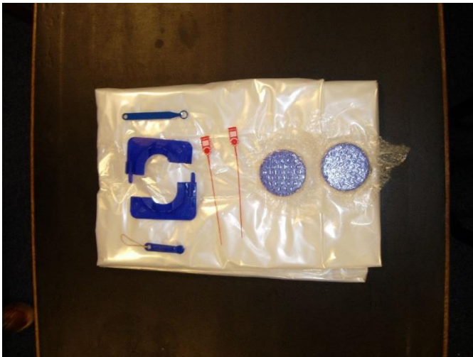
The liner, fixation clip, TE and key.

Liner : 1.000 litre Top Fill Container : 285 BD Version : 1001.V2