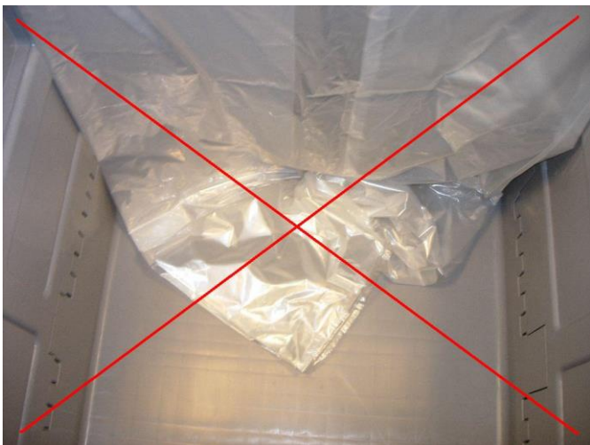
After the rear panel is in place, the bottom of the liner should still lay flat in the container.