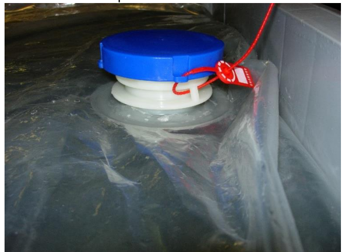
After the liner has been filled, an optional Temper Evident can be applied on the cap.

For more information feel free to contact our sales department: +31 346 251 831