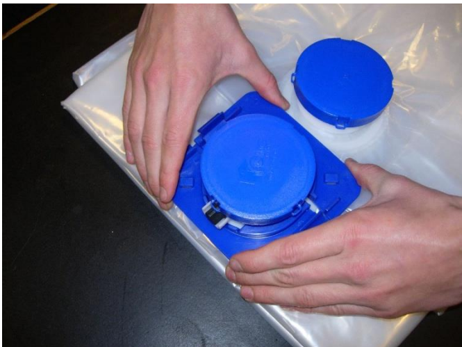
Place the second half of the clip and click the two parts together.