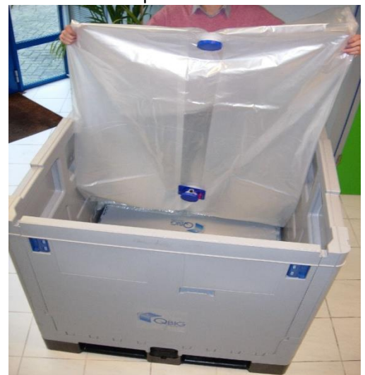
Unfold the liner totally with the valve on the lower side and pointed to the bottom outlet.