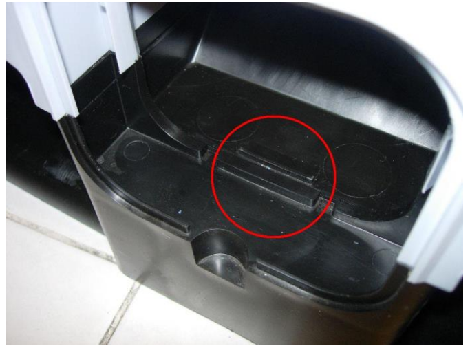
IMPORTANT, note the small channel at the bottom of the outlet. This is essential.