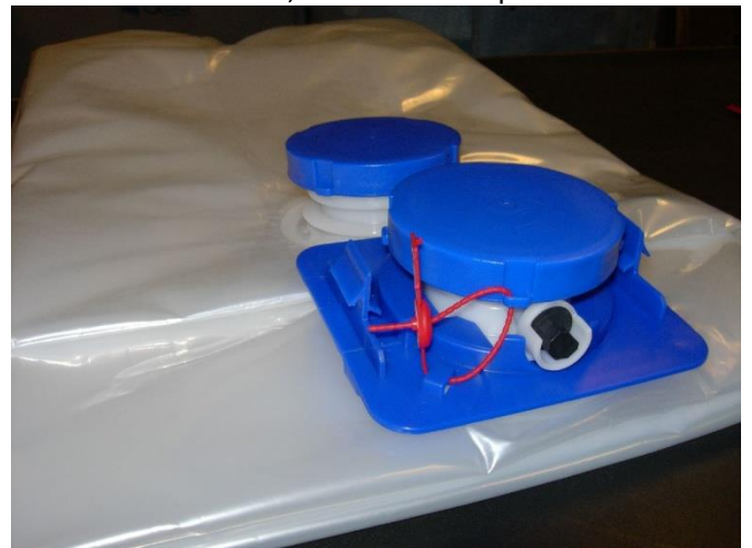
Apply an option Temper Evident between the clip and the cap.