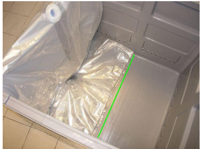
After the rear panel is in place, the bottom of the liner should still lay flat in the container.