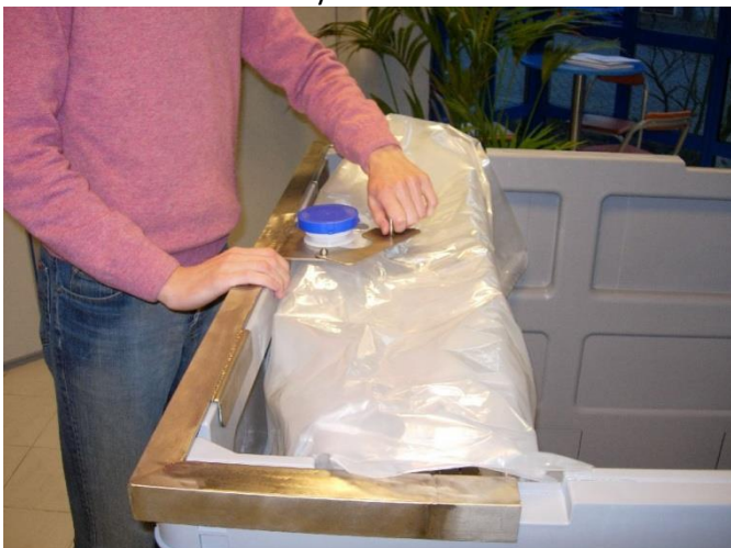
Attach the filling cap to the filling bridge, now the liner is ready for use.