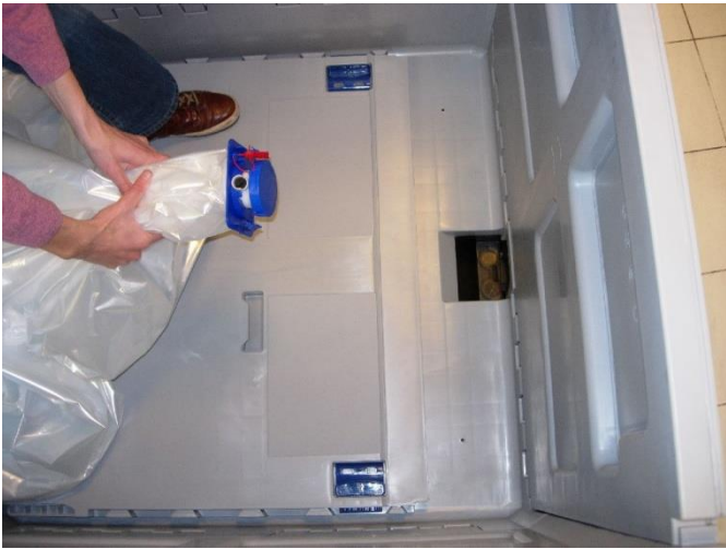
Fold/crumble the liner into a spout like shape.