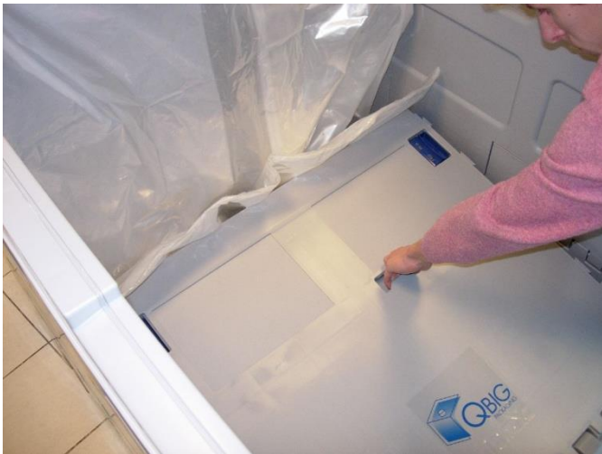
Pull up the rear panel gently and snap it into position.