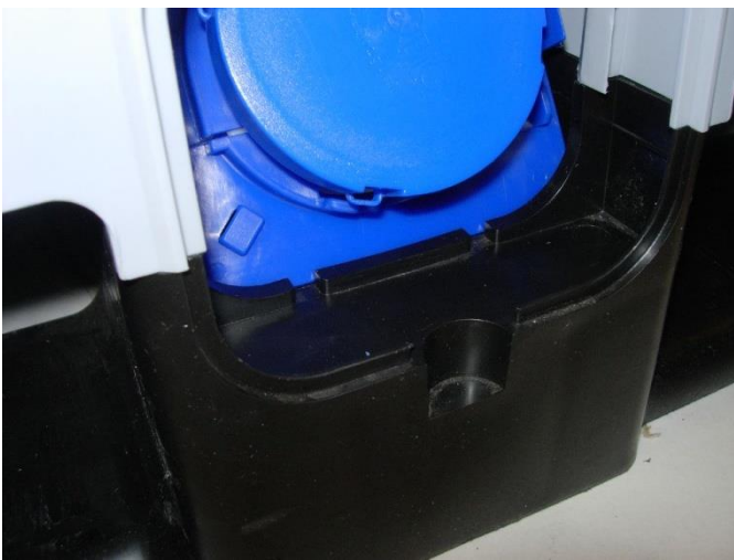
IMPORTANT, first place the underside of the clip in the channel, (outside view).