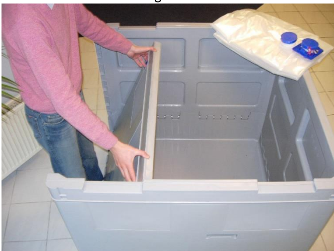
Fold down the panel opposite to the bottom outlet.